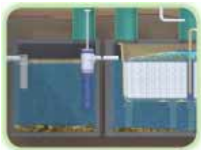
SaniTEE® Wastewater Screens